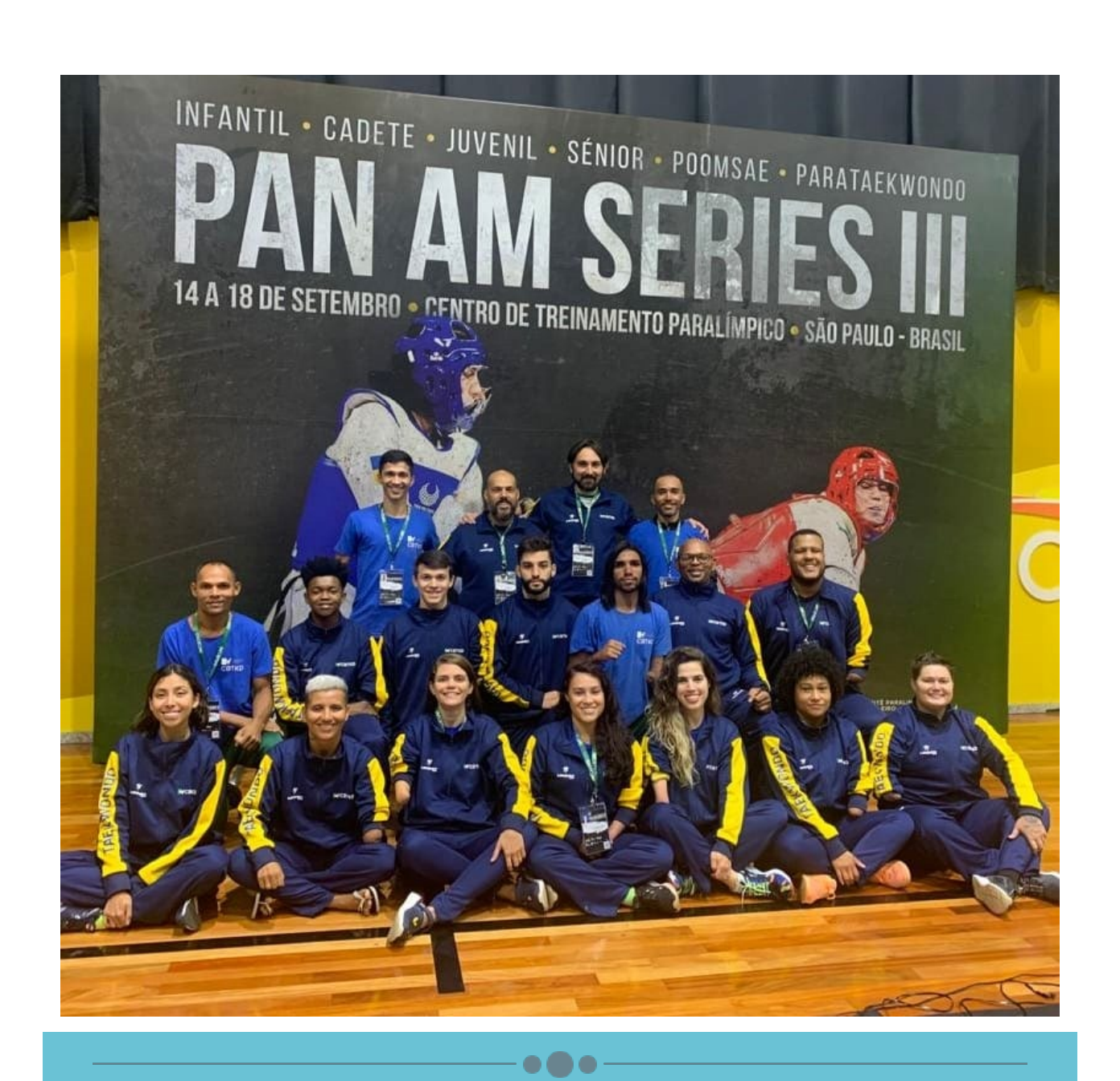
"Para Taekwondo is Better Than Ever" - Chelbat